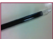
Tubeguard with End Caps